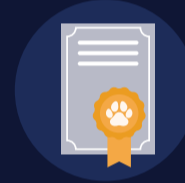
Veterinary certificate: preferably 2 copies – one on the owner and the other attached to the carrier/bag