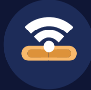
ID: a microchip registered with the Agricultural Data Centre