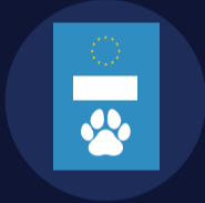
EU pet passport